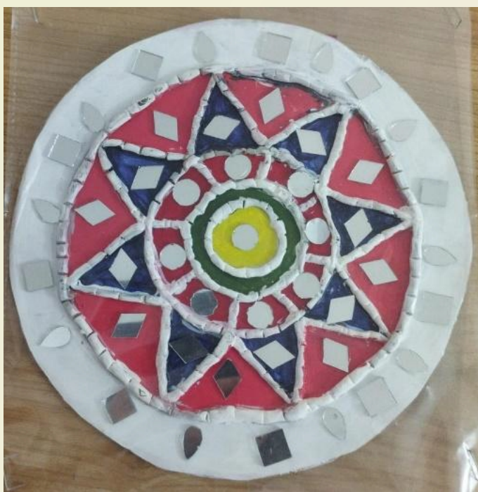
Name of Students: - Priyanshi Songar Grade: - 6A