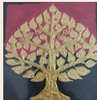
Name of Students: - Yohan Pepavanshi Grade: - 7C