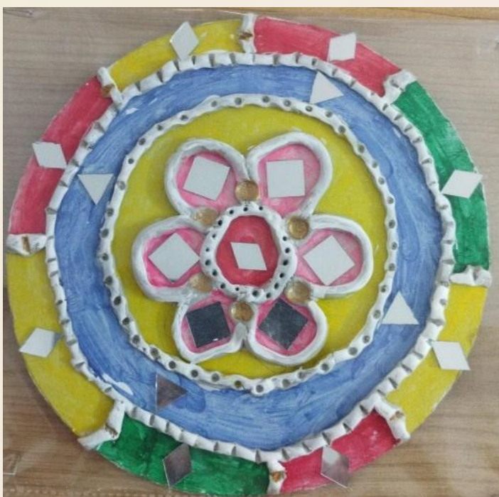
Name of Students: - Arpita Singh Grade: - 6B