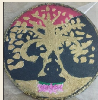
Name of Students: - Angel Umaraniya Grade: - 7C