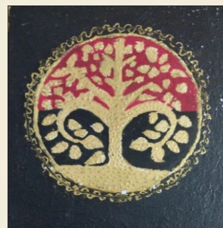
Name of Students: - Jaynil Solanki Grade: - 7B