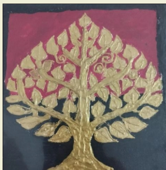
Name of Students: - Zaid Mohammed Grade: - 7C