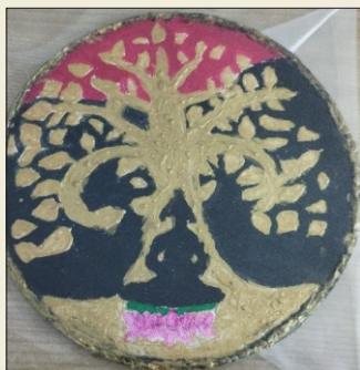
Name of Students: - Sunita Raylia Grade: - 7C