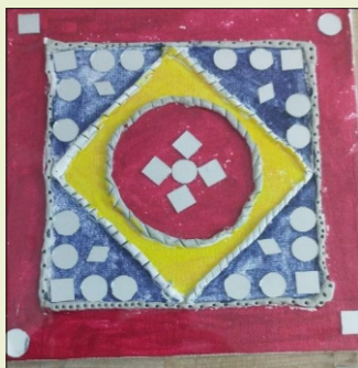
Name of Students: - Priyanshi Songar Grade: - 6A