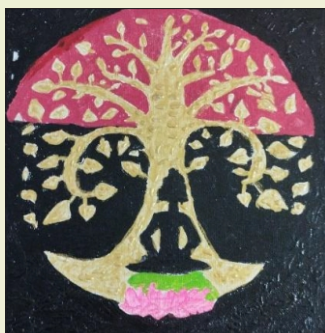
Name of Students: - Riya Savani Grade: - 7A