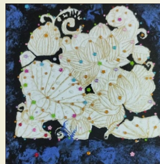
Name of Students: - Priyanshi Songar Grade: - 6A