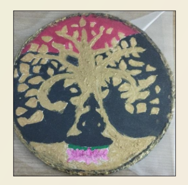
Name of Students: - Sunita Raylia Grade: - 7C