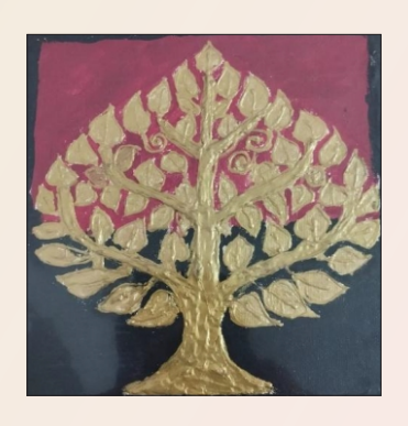
Name of Students: - Yohan Pepavanshi Grade: - 7C