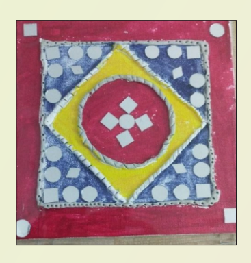
Name of Students: - Priyanshi Songar Grade: - 6A