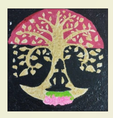
Name of Students: - Riya Savani Grade: - 7A