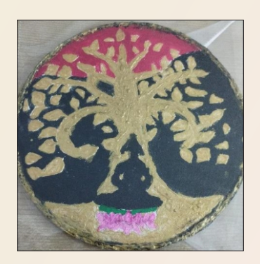
Name of Students: - Angel Umaraniya Grade: - 7C