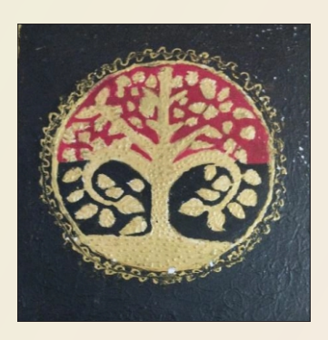
Name of Students: - Jaynil Solanki Grade: - 7B