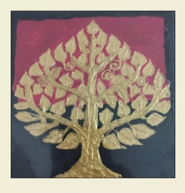
Name of Students: - Zaid Mohammed Grade: - 7C