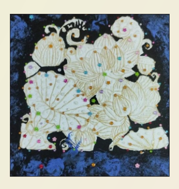
Name of Students: - Priyanshi Songar Grade: - 6A